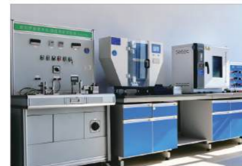
Inspection and Testing Equipments