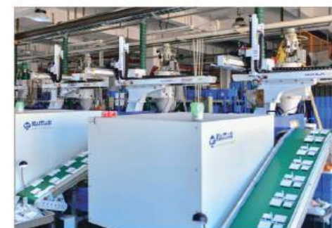
Pressing & Injection Workshop