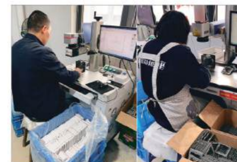
Panel Laser Printing