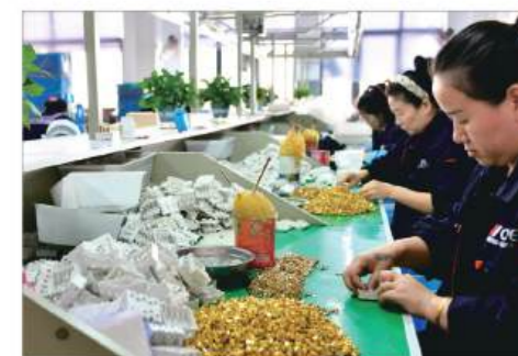
Parts Assmble Workshop