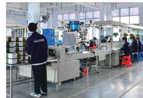
Finish Product Pack Workshop